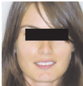
BEFORE Prominent protruding teeth with mish mash of colours and bonding