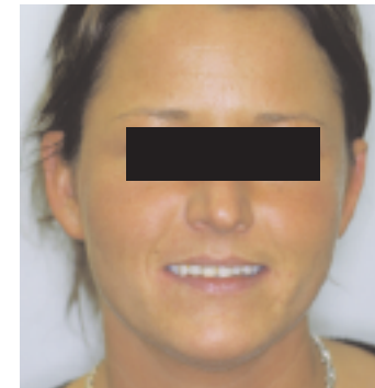
BEFORE Discoloured, stained composite veneers, incorrect proportions, form and harmony